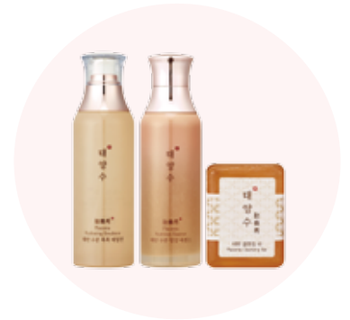
TAEYANGSU, Highly concentrated Placenta Nutrients