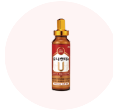
Unicenta Oral Solution, Human Placenta Nutrition

TAEYANGSU 油 is a Premium PLACENTA THERAPY which has nutrients from porcine placenta extract and other effective ingredients for anti-aging carefully chosen by UNIMED Pharm